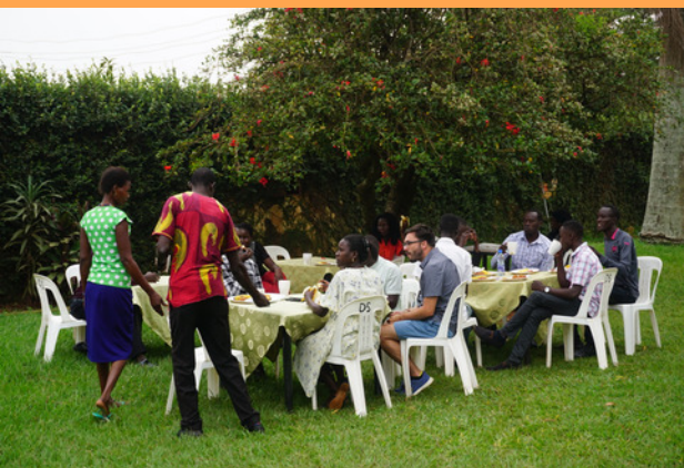
Uganda Care Leavers Retreat, a break from the workshop

Meanwhile, their voice has been captured through our research and will help advocate for care leavers rights and for the families first approach to child care.