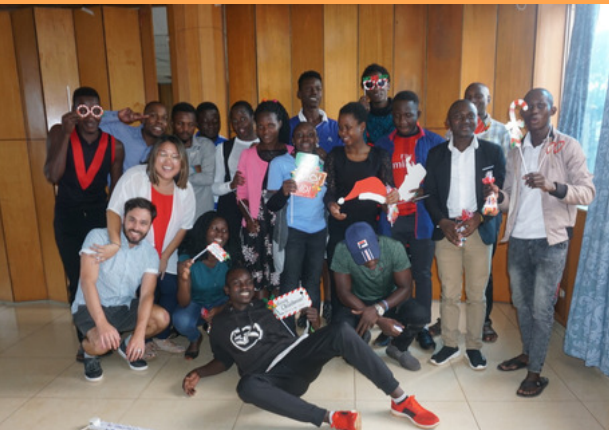
Recipients of educational support from BULA meet for a workshop on career development

Since 2013, BULA has continued to support the families that were reunited after the closure of an orphanage through committed social work and counseling. Running workshops for financial independence, regularly interacting with a dedicated social worker, offering counseling sessions with a licensed therapist, and offering career mentoring are among the major activities through Home at Last.