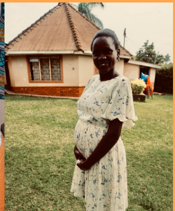
Chair of a district care leavers' group