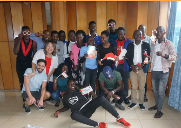
Recipients of educational support from BULA meet for a workshop on career development

The Educational Fund has been sponsoring the education of vulnerable youth since 2009. The students supported through this initiative are wrapping up their years of schooling in vocational and secondary schools. In 2018, we had students finishing up their education in mechanics and working in hands on internships – with others finishing up their secondary school education focusing on physics and mathematics.