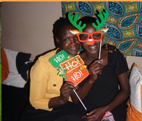
Celebrating the care leavers and the holidays