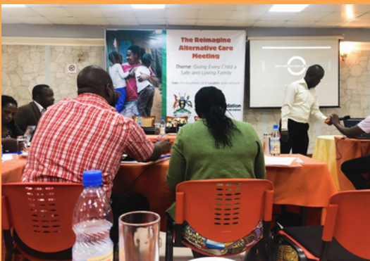
BULA participated in a workshop sponsored by Uganda's Ministry of Gender, Labour and Social Development to reimagine alternative care